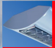
J2 - Options Louvres

Single or twin lamp with louvre or diffuser controllers