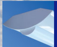
J0 - Options Frosted polycarbonate diffusers